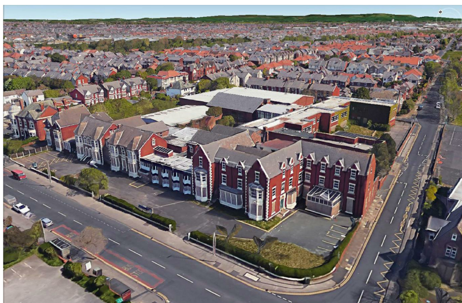
2 4 8